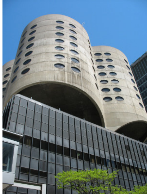
Prentice Hospital, a modernist marvel, located in downtown Chicago remains under threat by Northwestern University.

And my next bad news omen is also from New Orleans. Here is one of three or four cities in America whose primary competitive edge comes from its historic built fabric. And make no mistake about it, the food, the culture, the music of New Orleans is intimate with and inseparable from the built heritage. You lose the historic buildings and with them go the rest of the identity and international cultural contributions of New Orleans. So in June my colleague Cara Bertron and I were in New Orleans for the "Reclaiming Vacant Properties" conference. We've begun a Rightsizing Cities initiative, so we were there to learn what cities around the country were doing to incorporate historic buildings into their rightsizing strategies. One of the main speakers, of course, was New Orleans Mayor Mitch Landrieu. And he told the audience, "We're making great headway in resolving our vacant building problem." But he's not doing that by finding new residents; he's doing that by tearing down houses—many of them historic houses. And he further goes on to say, "Of course we have to deal with those preservationists who want to save everything, but we're getting rid of vacancies."