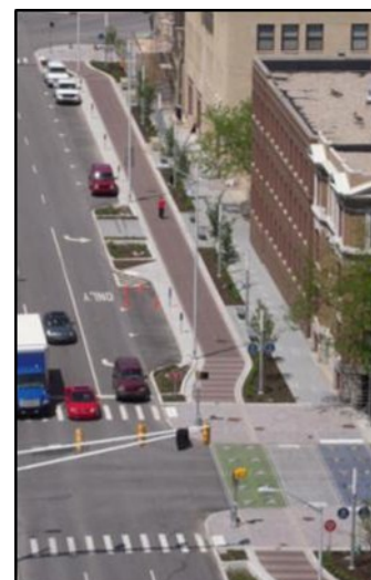
Figure 2: The Cultural Trail