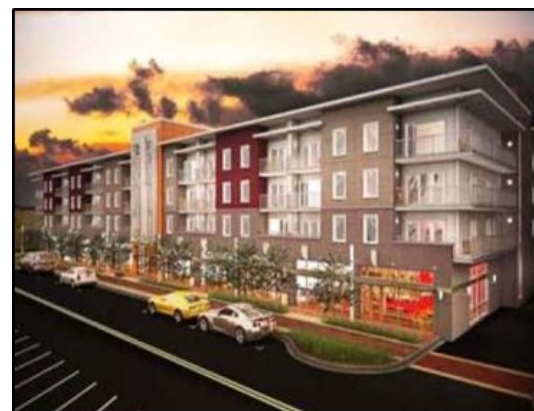
Figure 4: Rendering of Trailside on Mass Ave [Source: http://trailsideonmass.com/ ]

The downtown neighborhoods surrounding the Indianapolis Cultural Trail include both affluent and low-income communities. 48 As a result of the Cultural Trail and related transportation infrastructure investments, people are returning to the existing housing stock in downtown Indianapolis, and developers are constructing additional market-rate and affordable housing near the trail. Between 2001 and 2009, the city's population increased by 65,000 people, a growth rate 50 percent greater than the national average. 49 The 2010 census indicates growth in specific downtown neighborhoods, including along Massachusetts Avenue, a mixed-use corridor known for its arts scene. This is one of the city's most densely populated neighborhoods, and its growth over the past 10 years demonstrates the importance of walkability and access to area residents. 50 The Cultural Trail was strategically located to enhance such features in this and other neighborhoods.