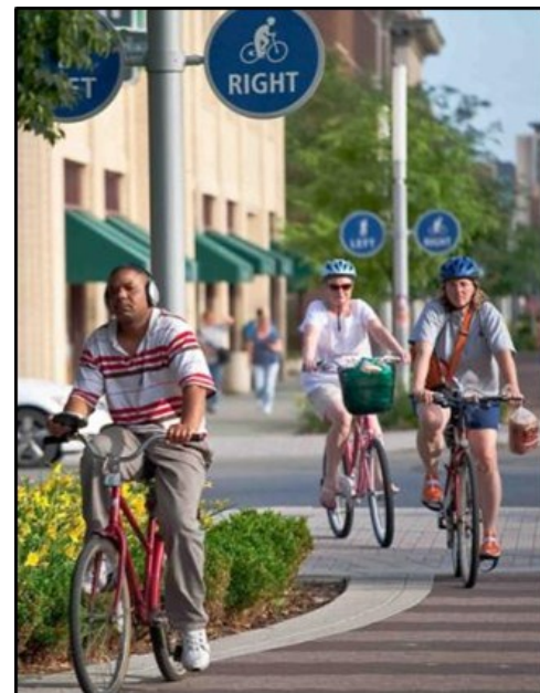
Figure 5: Indianapolis Cultural Trail